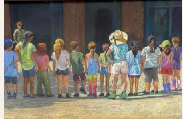
Best in Show 2022